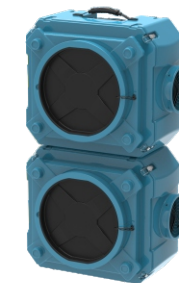
Ultra Secure Stacking