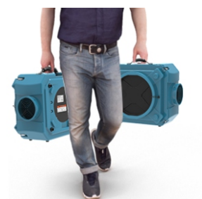
Light And Easily Transportable