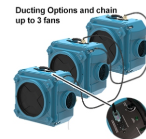
Chain up to 3 fans