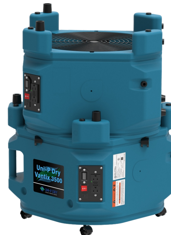
Ducting Options and chain up to 4 fans