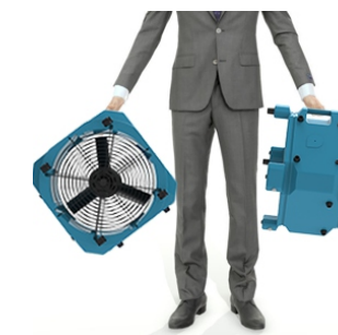
Compact & Light Weight