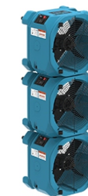
Ultra Secure Stacking