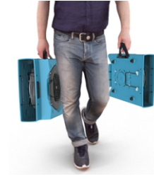
Compact & Light Weight