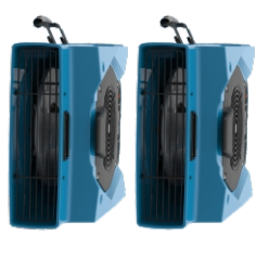
Half the height of standard carpet dryers