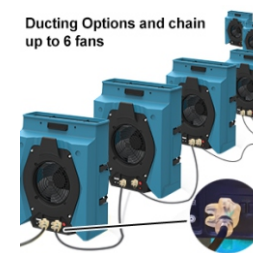
Chain up to 6 fans