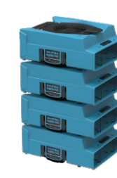
Ultra Secure Stacking